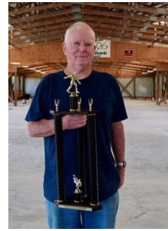
40 FT CL A Rosser