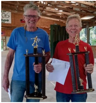
30 Ft CL B State 1 st Brand